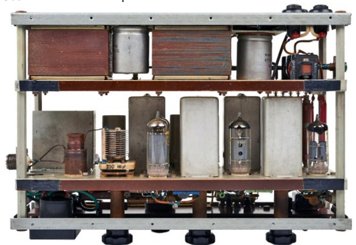
Top view of 300A transmitter with covers removed. (above)

This chapter is an abridged version based on a full account of the 300A described in www.cryptomuseum.com . Photos taken from the 300A held in the collection of the museum, and information from the website was published with kind permission of the Crypto Museum, Eindhoven, Holland.