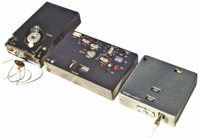
Pivoňka elbug used with a 'Lipan' Czech agents transmitter and unknown receiver. (above)

Accessories: Cable for connecting to transmitter, earphone.