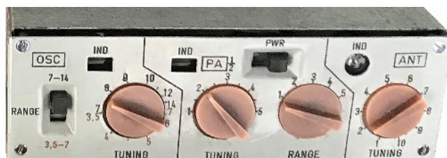
Front panel view of the S-50B transmitter unit.

The S-50B-S was a radio station used by agents and probably other agencies, operating on short wave. The set comprised 6 units: transmitter S-50B, AC mains power unit, 12V DC power unit, synthesiser unit, Philips EL 3302 compact cassette recorder (used as high speed keyer) along with the associated high speed keyer interface PMS. Preparing compact cassettes was done with a separate high speed Morse encoder unit Type HNK which was also used with the ELK-S described in Chapter 279. A separate receiver was used, model KF, mentioned in the operating instructions. Developed between 1970/71, the S-50B transmitter was much later used in a suitcase version along with most likely the same type of synthesiser, and an unknown Morse keyer (See Chapter 269).