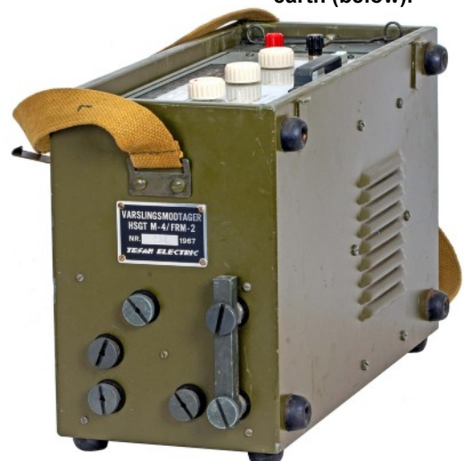
Left hand side view with connections to aerial and earth (below).