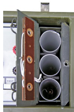
Right hand view of front panel with battery compartment opened (left).

The HSGT M-4/FRM-2 was a portable warning receiver believed to be used by the Danish Civil Defence. The receiver was fully transistorised, enclosed in a wooden box with a removable protective lid over the front panel. Its electrical design and mechanical construction reflected that of commercial broadcast radio receivers of that era. It was powered by nine 1½V 'D' cells which were located in a separate compartment on the right hand side of the front panel. Provision was made to connect an external 12V DC source via sockets on the front panel.