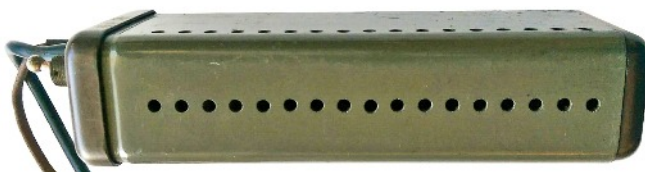
The green plastic case was identical to the receiver or battery pack but had 51 cooling holes (3 rows of 17 holes).