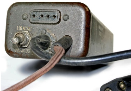
Top view of the RBZ Power Pack showing the mains voltage switch, socket for connecting the RBZ, headphones cable/plug and mains cord.

RBZ receivers were known to be dropped to resistance forces in occupied countries. Once the special batteries were used, new replacements were hard to obtain. An AC/DC mains power pack was developed for use with this receiver as a substitute, officially designated 'Power Pack for RBZ Receiver'. It had similar dimensions as the original battery box; the RBZ could be plugged in directly without any modifications. The mains power pack for the RBZ shown in this chapter was located in Norway along with a standard RBZ receiver. This supplement chapter is a follow up and should be read in conjunction with the 'Receiver RBZ' section in the 'USA' chapter of WftW Volume 4.