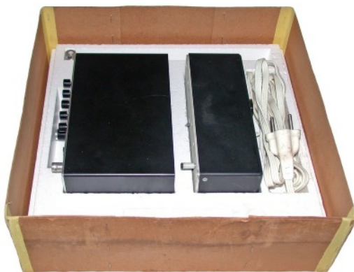
Topas transmitter with accessories and mains power unit in a cardboard transit case.