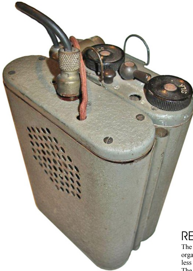
OP3-G Country of origin: Polish in England