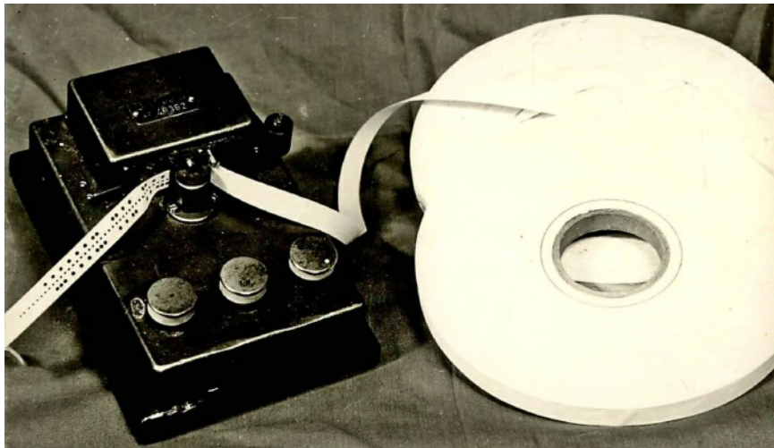
This photo shows how a paper tape in Wheatstone code was prepared by means of a G.N.T. Co hand operated puncher, a very simple and almost indestructible little encoder.