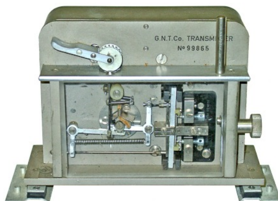
A hand operated Great Northern Telegraph Co. Wheatstone transmitter was used as a high speed Morse keyer.