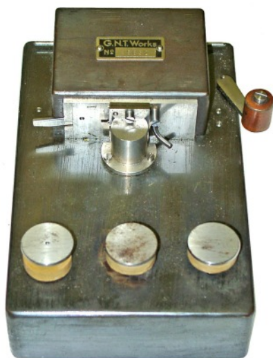
Great Northern Telegraph Co, Wheatstone hand operated tape puncher used for preparing a tape.

In the 1950s the British secret service issued paper tape based G.N.T. Co. Wheatstone transmitters and punchers to their agents for use as high speed keyers. These instruments were commercial made, very robust, not complicated, not requiring electric power and could be used with any agents radio transmitter. The keyer was principally a hand operated version of the well known and widely used Model 122. The tape puncher was a standard hand operated GNT model. Both keyer and puncher were hand operated and did not require any electrical power. The paper tapes were prepared on the small puncher which had three buttons: dots, dashes and spaces. The G.N.T. Co. transmitter, hand puncher and the Mk.123 agents set on the photos of this chapter were captured by the MfS HA II (Hauptabteilung II Spionageabwehr), in the GDR.