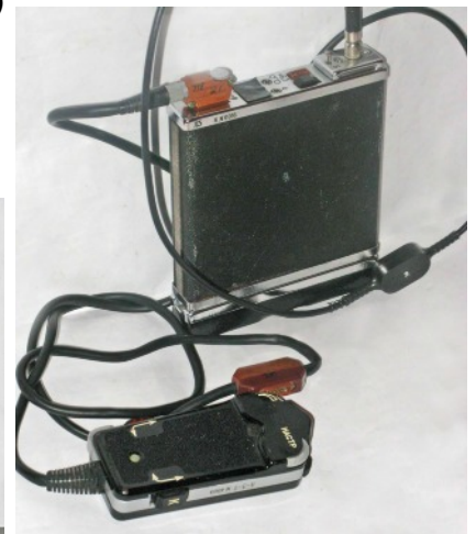
Lily receiver with associated flexible wire aerial and remote control unit.