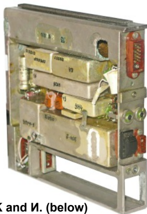
Plug-in RF units marked K and И. (below)

The main unit of the receiver had a cast aluminium frame with sealed modules. The rechargeable battery slides in the top, and the plug-in RF module in the lower compartment.