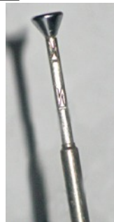
Special ground plane aerial with adjustable elements. (Left and below)