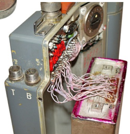
Internal view showing one of the two fully sealed modules.