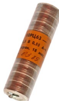
Rechargeable 12V battery.