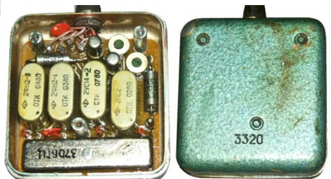
Internal view of components and bottom view of the external speech masking (scrambler) unit.