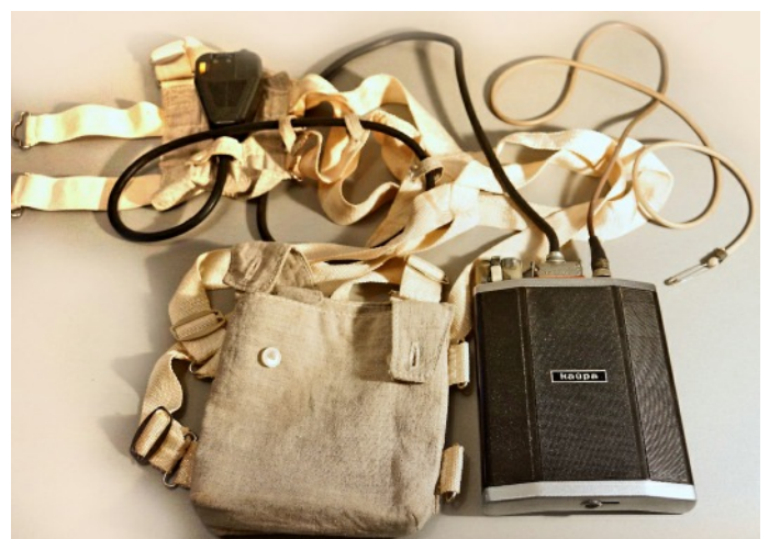
Complete Kaira with associated linen body harness for carrying the set under the clothes on the chest.