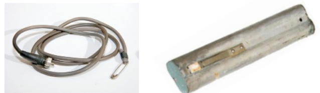
Flexible wire aerial with safety pin for attaching to the clothes. (Left) The battery/rechargeable accumulator holder was identical to that of the Chaika. (Right)

Kaira (Russian: Кайра) was a fully transistorised body wearable VHF FM transmitter-receiver developed for covert and special operations. The radio was shaped to be worn under the clothes on the chest carried in a linen body harness or bag. The combined speaker/microphone had a volume control, on/off switch, PTT button; two variations were noted, with and without an extra covert speaker/microphone. One source suggested that the Kiara was a replacement of Chaika (described in Chapter 181).