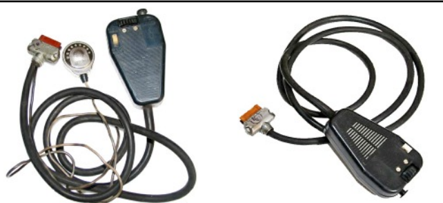
Two variations of the combined speaker-microphone.