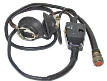
Microphone and headphones assembly.