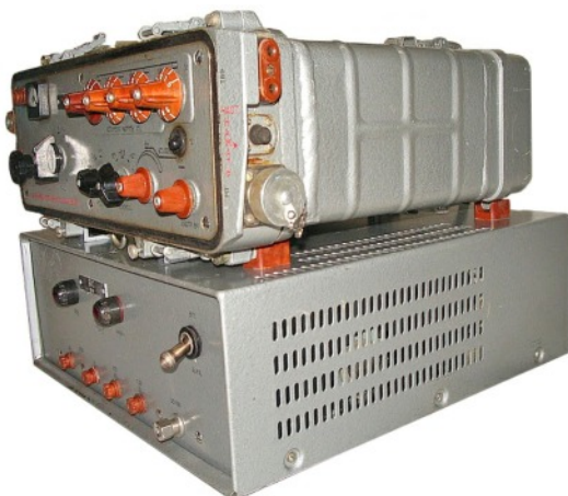
Right hand side view of Litharge-Z. The power socket and headphones connections are on the side. Note that the transceiver's enclosure is sprayed hammer tone paint whereas the portable version was green.