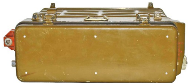
View of Litharge with waterproof top cover closed.