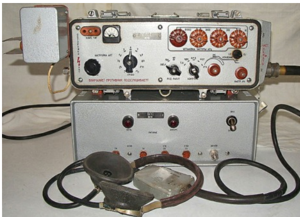
Front panel view of Litharge-Z with AC mains power supply unit BPS (БПС). Note an aerial adapter unit top left.

Litharge, Russian: ГЛЕТ (Glet = a natural form of lead. PbO), was a self contained portable HF radio station, used by special forces e.g. Border troops. Two variations of this radio were noted: Litharge-H and Litharge-Z), the latter issued with a type BPS AC mains power unit for fixed operation. Internet sources believe that the Litharge might have been a predecessor of the R-143. At the time of writing no further details were found. Additional information or corrections to the current data is most welcome.