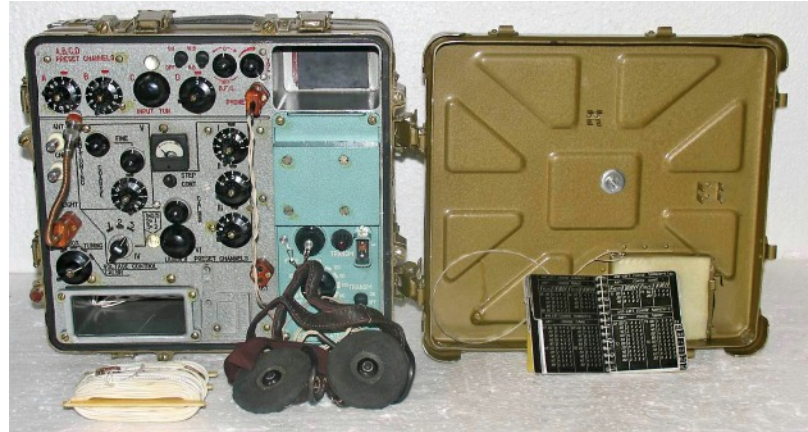
Front panel view of R-393, believed the B version without high speed Morse keyer.