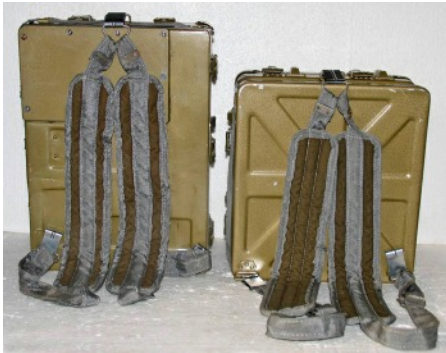
Rear view of power unit (left) and R-393, showing carrying arrangements.