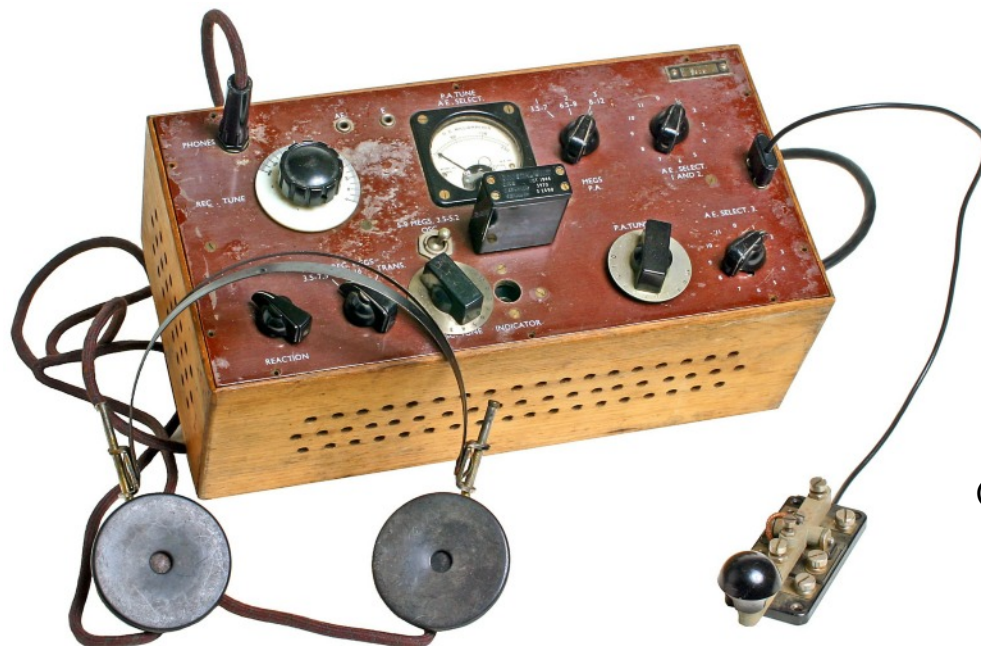
Mk.V'2 Country of origin: England