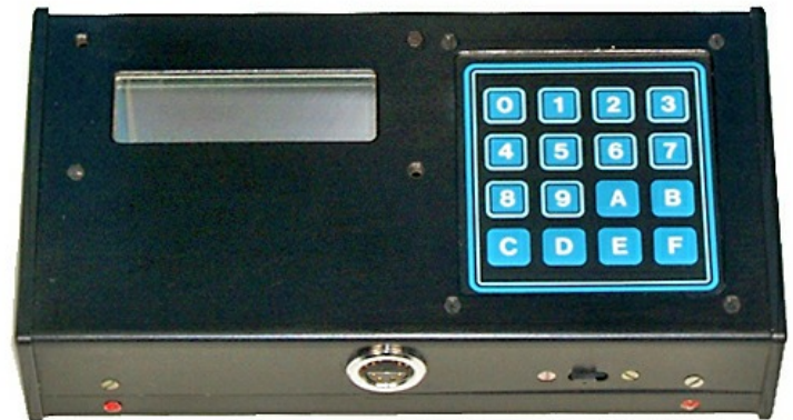
WSA 6 transmitter 32212, (left) and associated high speed keyer 32843 (above).