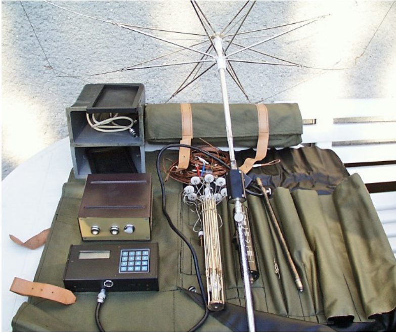
WSA 6 transmitter and high speed keyer 32843 with complete 32210-64 umbrella aerial packed in a canvas cover. (Left)