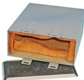
A waterproof metal container issued when the set was buried for later use. (Left)