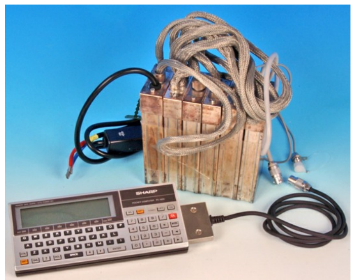
WSA 6 six-module variant for covert installation in e.g. a vehicle. A commercial Sharp PC 1600 (below) was used as control unit.