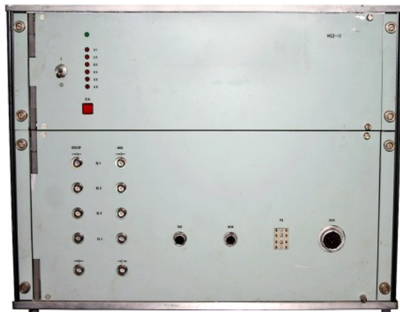
The MEZ 12, cover name 32213, was part of the WSA 6 system at the base side, normally in combination with an EKD 300 receiver. (Above)

Two variations are noted: a compact variant fitted in a metal box (see photo on top left) and a six-module variant for covert installation (bottom left). It was normally used with high speed keyer 32843, described in Chapter 139.